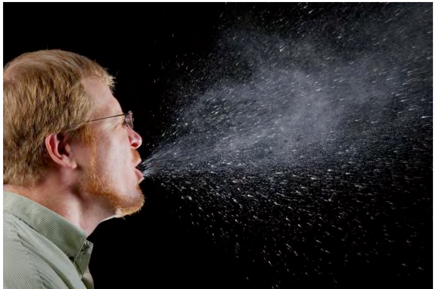
Actual photograph of a person sneezing

This document is primarily sent out by e-mail to NISO members and to interested parties. If you wish to unsubscribe please e-mail us at: newsletter@niso.ie and put "unsubscribe" in subject line.