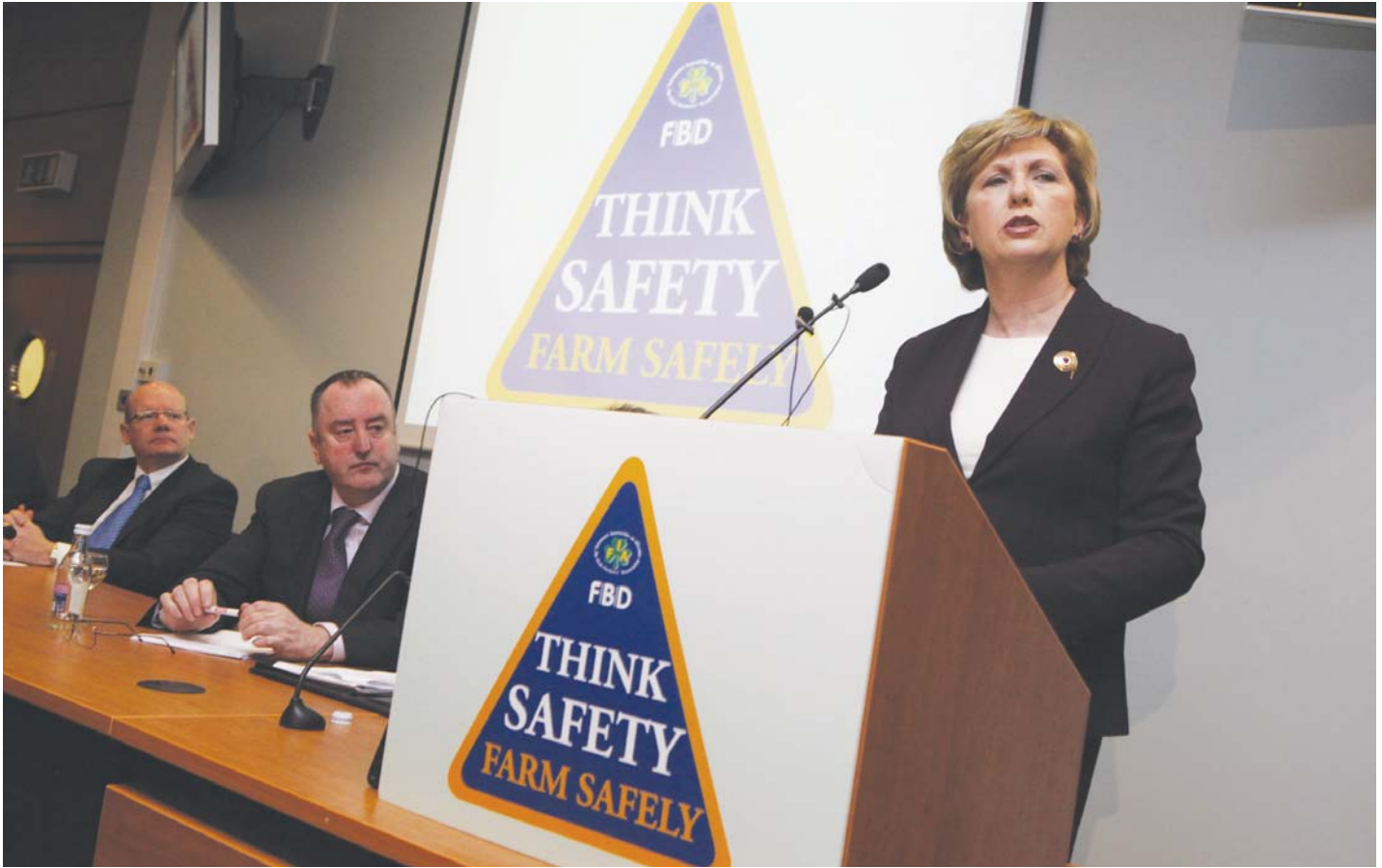
Mary McAleese, president of Ireland launching the IFA farm safety campaign, 'Think Safety - Farm Safely'.

2010 was the worst year for farm accidents in recorded history, 26 people lost their lives and approximately 1,500 people were injured on Irish farms. This compares with 11 farm deaths in 2009. Farming accounted for over 50% of the work related deaths reported to the Health and Safety Authority (HSA) in 2010. In addition, there was an increase in the number of fatalities in the active farmer bracket (i.e. farmers aged between 19 and 65 years).