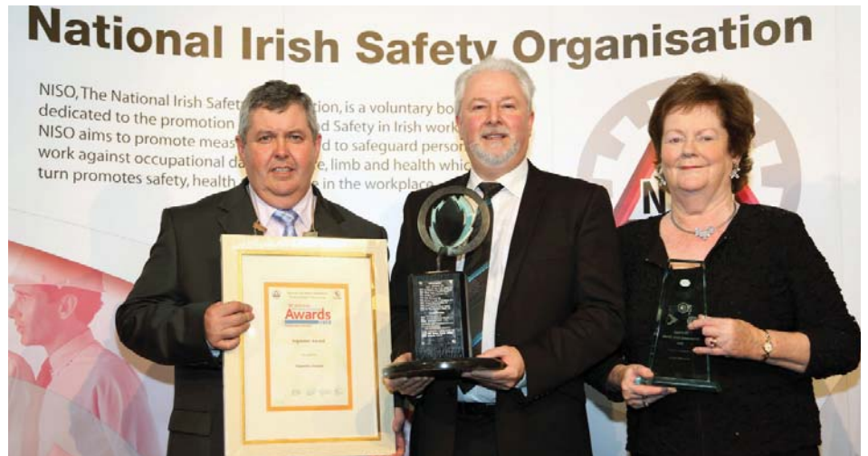
Masonite Ireland; Supreme Award winners 2010

This year's NISO/NISG awards include a number of new business categories, including education and training, facilities management and services, financial / insurance, sport / leisure, waste management and road finishing contractors. The 2011 awards scheme also sees the introduction of a new award category called the 'Commended Award'. Organisations achieving this new award category must demonstrate the existence