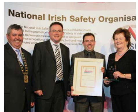
Designer Group, Engineering Contractors, President's Award (Construction)