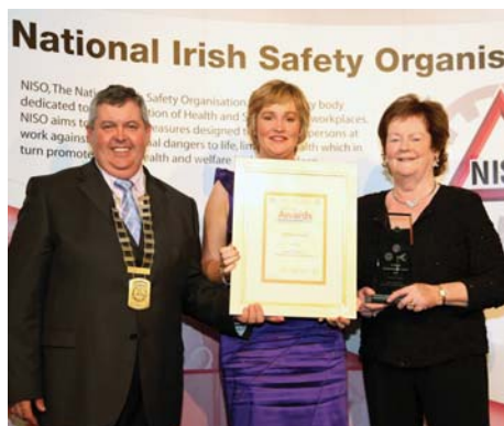
Baxter Healthcare, Platinum Award

The winner of the Supreme Safety Award is an organisation that shows consistency in safety performance over a number of years, and an outstanding contribution to occupational health and safety throughout the current year.