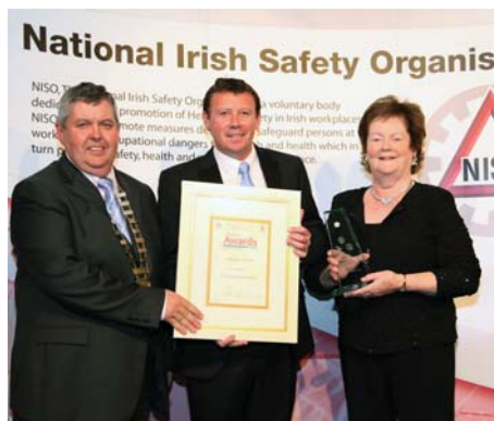
Sky Handling Partner Ltd, Business Sector Award (Transport)